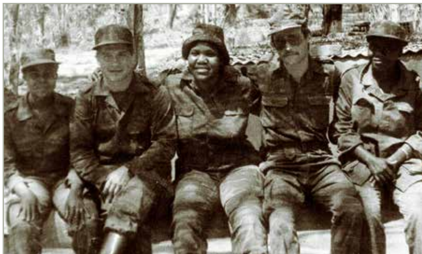
Right from a PLAN underground classroom, Jamba Training Center, Angola, 1987

Central Hospital were PLAN fighters and commanders wounded in combat situations on enemy-controlled territories or on the territory of Angola, in contact the SADF or UNITA. Soviet advisors to SWAPO and their family members were also treated by the Soviet medics from the Central Hospital.