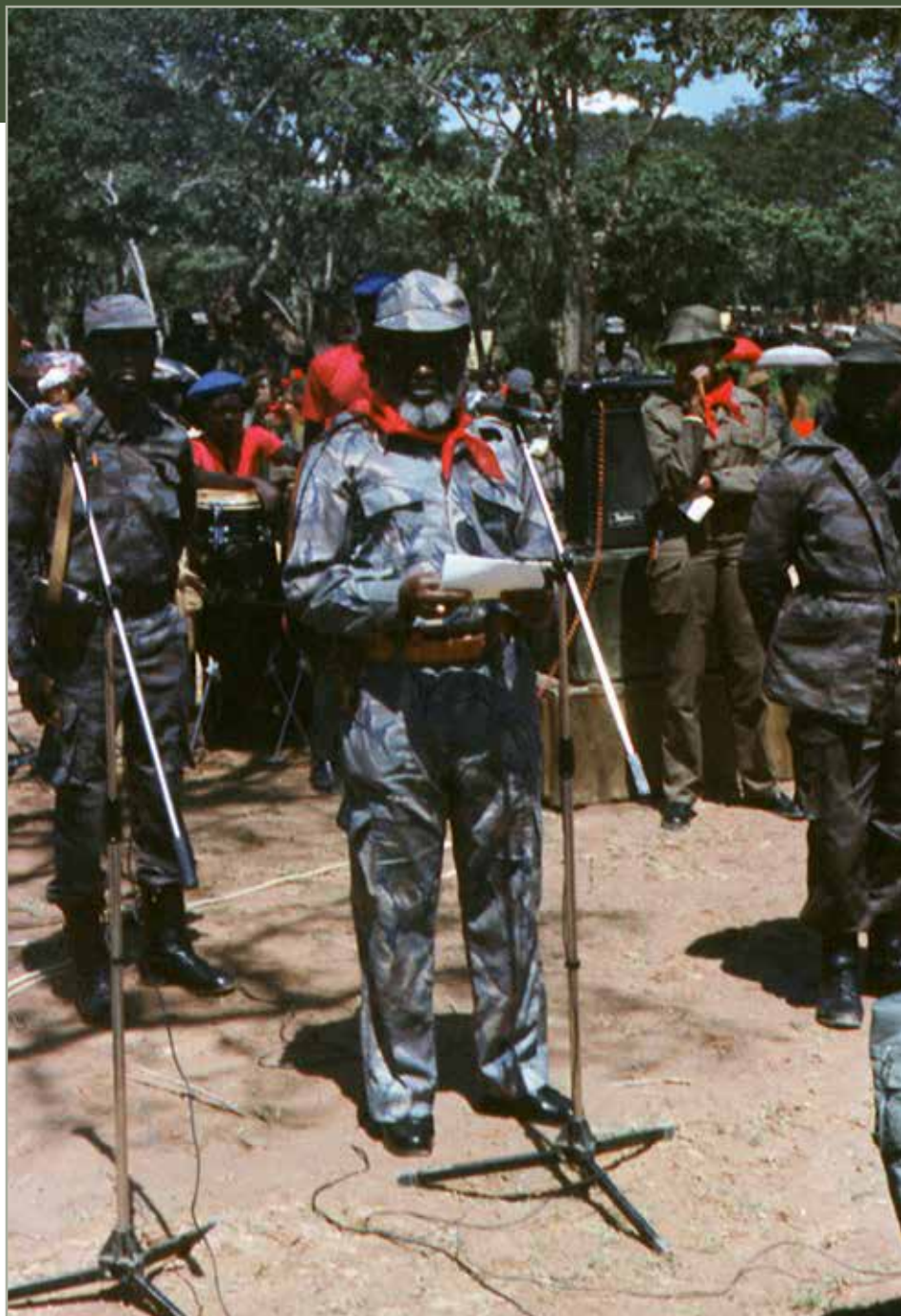
President of SWAPO Sam Nujoma addressing personnel of a SWAPO brigade in Angola