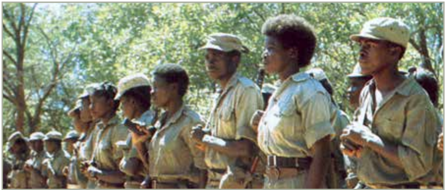
SWAPO PLAN base, early 1980s

the Union of South Africa as a mandate territory, which in fact meant keeping its status of a colony. In 1946, as a result of the victory of the anti-Nazi coalition headed by the Soviet Union, the USA, and Great Britain, the United Nations Organization was established. The UN rejected South Africa's request to annex