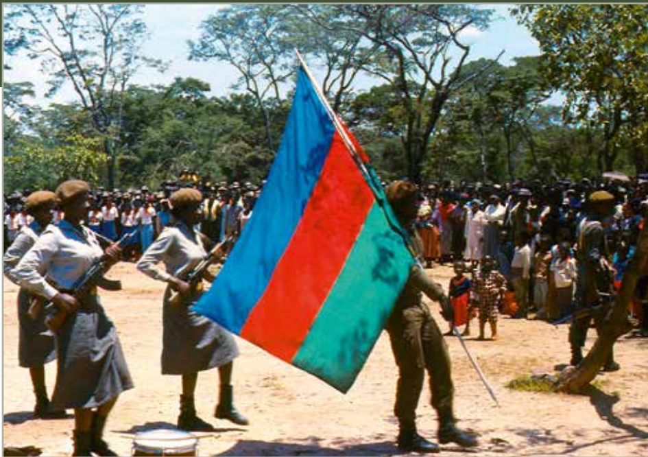
Trooping the Colour, Namibian refugee camp, Cassinga, Angola

African government agree to negotiations. The negotiations, that ended in New York 22 December 1988, resulted in the signature of a trilateral agreement between South Africa, Angola and Cuba on external aspects of the settlement of the Angolan conflict. This agreement eventually brought peace to the whole south-western Africa. South Africa agreed to withdraw its troops from Namibia, while the Cuban troops left Angola.