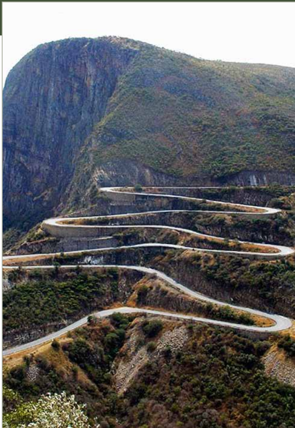
Serra de Leba, Huila province, Angola