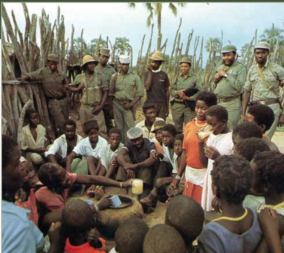
SWAPO fighters in a village reconquered from the SADF

advisors to SWAPO in Lubango, as well as with the Cubans, local authorities and self-defense forces. Soviet military experts worked in PLAN20 Brigade until November 1987.