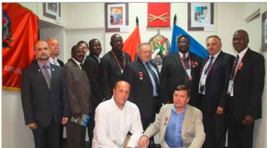
Members of the Namibian Military delegation and activists of the Angola Veterans Union paying visit to the Museum of the Union. Moscow, 2016.

of chemicals and other materials, and provision and installation of training and laboratory equipment. In 2009 and 2011, Russia, at the behest of the Namibian Government, sent humanitarian supplies to Namibia to help its citizens who had been affected by natural disasters.