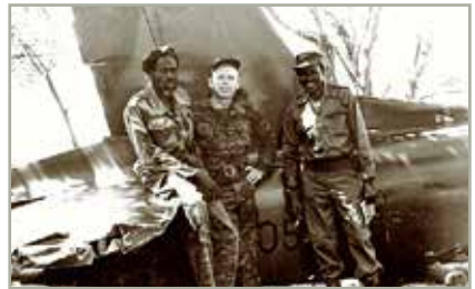
SAAF Impala aircraft shot down by SWAPO AA forces; Soviet military advisor Colonel A. Skurydin with SWAPO PLAN fighters

objective was tasked to the leaders of the Training Center to get down to the creation of regular military units for the future independent Namibia. It was a difficult task because the guerilla warfare training had to be continued in parallel. The instructions package was adjusted accordingly, and the training course was extended from three to six months. The Namibian cadets of the next training cycle formed two brigades, following the organizational structure of a regular army. At the same time, guerilla training was continued..