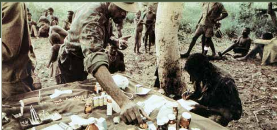
Medical check-up at a Namibian refugee camp, Angola

Soviet army doctors from the Central Hospital performed primary medical check-ups of SWAPO fighters – each of them had a medical record. From time to time, Soviet doctors visited Namibian refugee camps in Angola to provide first aid or other healthcare services to their inhabitants. Patients of the