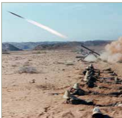
SWAPO troops firing "Grad-P" light portable rocket systems in the Namib Desert, Angola

After the withdrawal of SWAPO forces from Andulo, the city was taken over by UNITA, and Jonas Savimbi's HQ was established there. In December 1998, after the violation of the Lusaka Accord by UNITA, large-scale combat operations began. In September 1999, the government forces managed to reconquer the city, and one of UNITA's biggest bases in Angola ceased to exist.