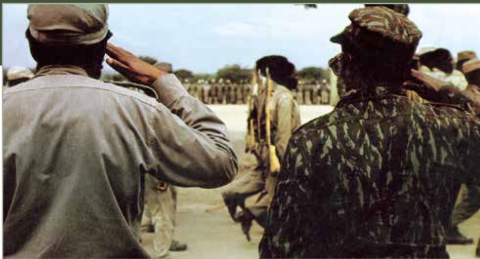
President of SWAPO Sam Nujoma reviewing SWAPO troops, Angola, 1987