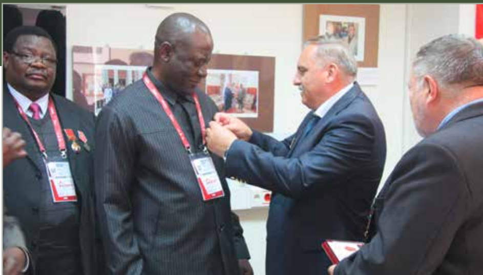
Namibian Military delegation members who have visited the residence and the museum of the Angola Veterans Union in Moscow in 2016 were awarded medals "For Rendering International Assistance to Angola"

approximately 2 thousand Namibians have graduated from Russia's higher-learning institutions. In December 2011, Russia provided the Department of Chemistry of the University of Namibia with free technical aid to the total amount of 1,65 million US dollars by way of supply