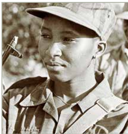
PLAN fighter

In 1974, after the Carnation Revolution in Portugal, when the country's new government declared independence of its former colonies, including Angola, the situation drastically changed for SWAPO. The door was open from Angola directly to Namibia. Loyal to the principles of internationalism, the MPLA government,