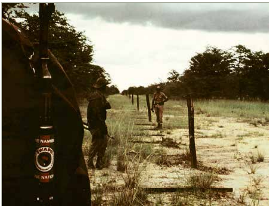
SWAPO unit crossing the Angola-Namibia border, 1978