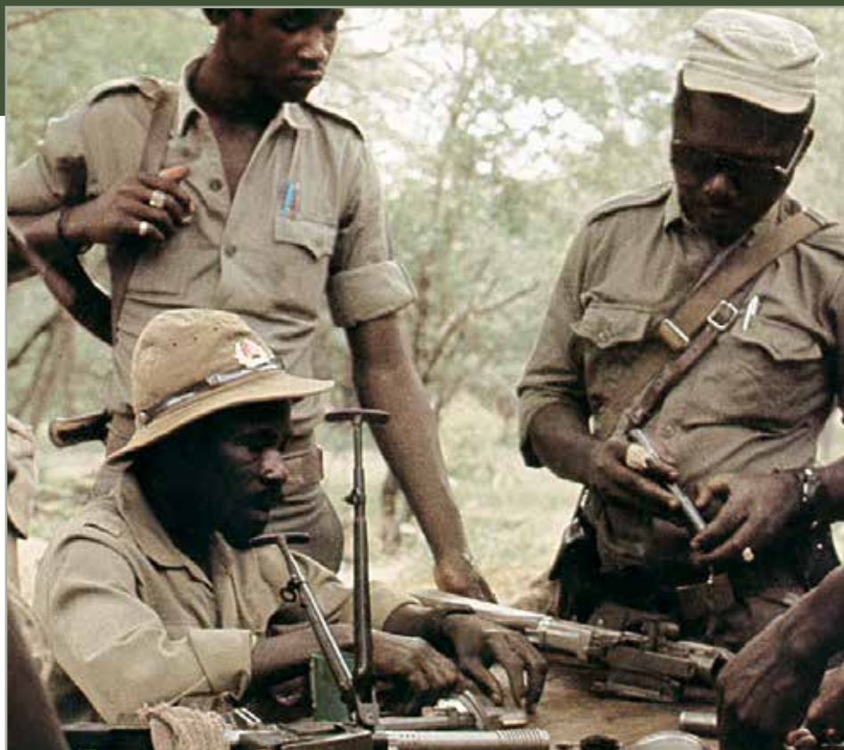
PLAN maintenance platoon, Lubango, Angola

pilot. To celebrate their first air victory, SWAPO fighters organized a feast with demonstration of the aircraft wreckage and Namibian folk singing and dancing.