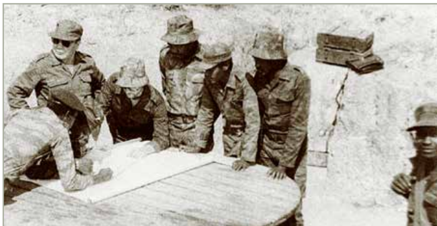
Soviet military advisors helping to plan an operation against UNITA, SWAPO PLAN20 Brigade, Andulo, Bié province, Angola, 1987

UNITA. Besides, they provided assistance to the local population, including food supply and medical aid. PLAN fighters escorted convoys with foodstuffs, weapons, and munitions coming from Huambo. They enabled uninterrupted