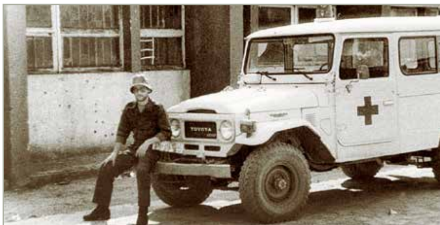
SWAPO PLAN20 Brigade, Andulo, Bié province, Angola, 1987

A team of Soviet army doctors worked in the Central Hospital of SWAPO since