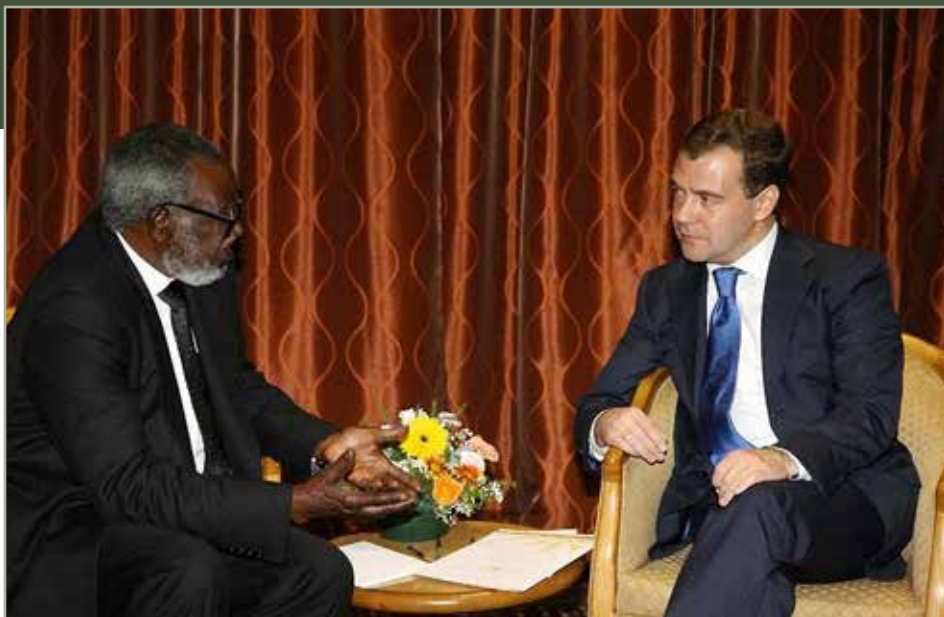
Dmitry Medvedev with Sam Nujoma, the first President of the independent Namibia, 25 June 2010