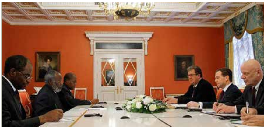
Dmitry Medvedev meeting Sam Nujoma, the first President of the independent Namibia, 5 February 2010

14 September 1989, Sam Nujoma returned to Namibia. 6 November, elections to the Namibian Parliament were held, and SWAPO won 57% of