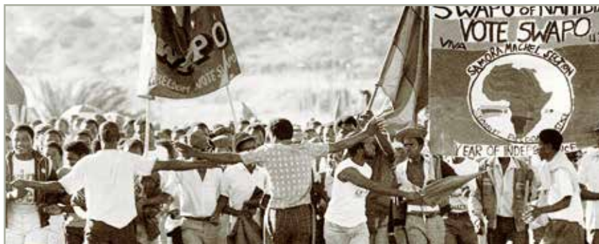
SWAPO supporters before elections, Namibia