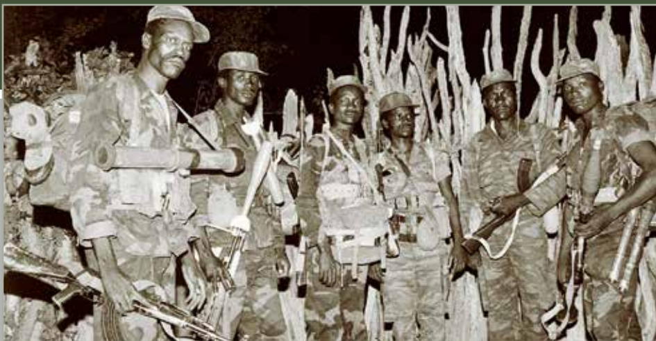
PLAN fighters on the Angola-Namibia border

International Court of Justice ruled that South Africa's administration was illegal. However, the apartheid government of South Africa refused to accept this ruling and extended its criminal policy of race discrimination to South-West Africa. The occupation of the Namibian territory by South Africa along with the coercive policy of apartheid caused righteous indignation on the part of the local population of the country.