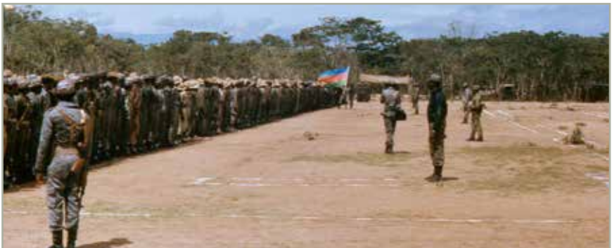
SWAPO PLAN brigade field day, Tobias Hainyeko Training Center, Angola