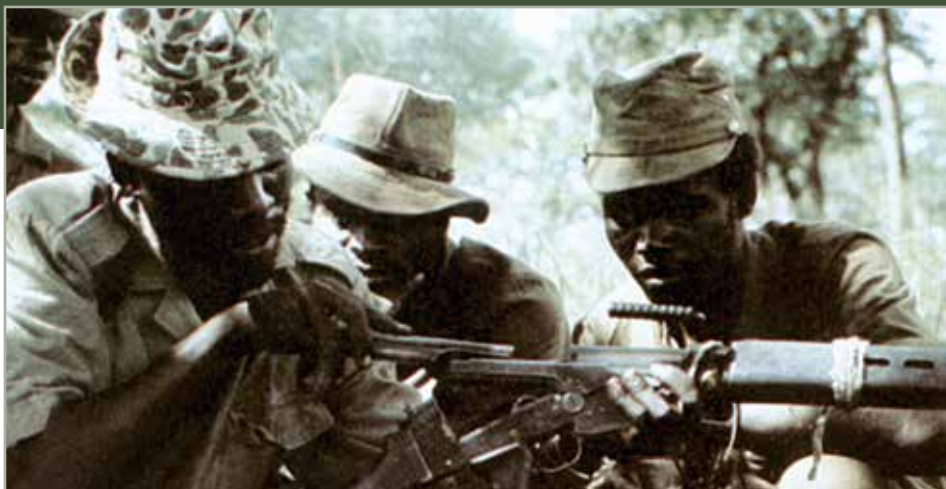
Mastering firearms, SWAPO PLAN training center, Angola

means. An international training center was created in Kongwa (Tanzania) to provide training to freedom fighters from some countries of southern Africa, including Namibia. The first group of Namibians arrived in Kongwa in April 1964. According to different sources, the group comprised between 12 and 15 people. Among them was Tobias Hainyeko who became head of the Kongwa camp and was then promoted to commanding officer of the South-West Africa Liberation Army (SWALA), predecessor of the People's Liberation Army of Namibia (PLAN). Tobias Hainyeko was killed in a skirmish with the SA police in May 1967. Later, the SWAPO training center in Lubango area (Angola) was named after him. The instruction package of SWALA included the basics of guerilla warfare, firearms training and explosives techniques. Different sources claim that in the period of the armed struggle SWAPO lost about 13 thousand PLAN fighters with the total number of casualties including